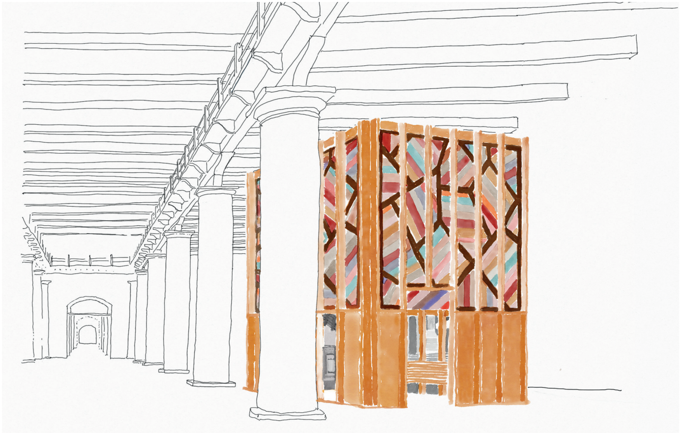
installation view © Sauerbruch Hutton