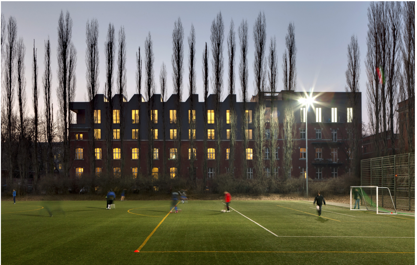
Sauerbruch Hutton's office in Berlin