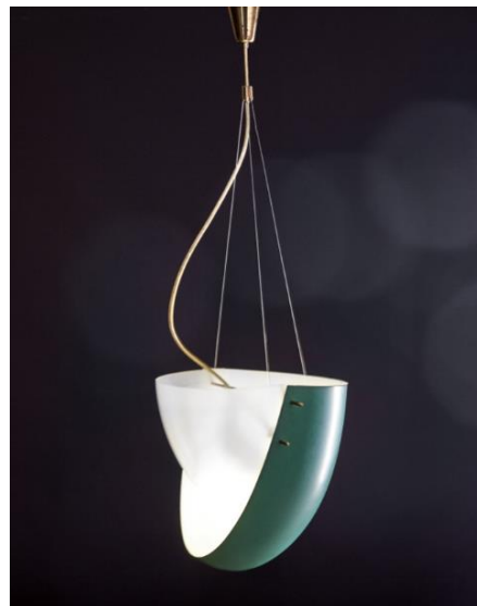
Ettore Sottsass, rare suspension Arredoluce , 1957, estimate: 50 000 € - 70 000 € / 57 500 - 80 500 $

Still in the early 1970's, Ettore Sottsass joins another Italian House of luminaries, Stilnovo . For them he designs a series of strange ceiling lights named Manifesto . They consist of a steel tube chrome plated, existing in two sizes and ending by a metallic sphere red which hides the light source. For Sottsass, it was important to give the furniture an architectural character and to shape space by creating bouquets of bright stalactites. A set of four of these ceiling lights will be presented during the Repertorio Sottsass auction , estimate 4,000 - 6,000 € / 4,680 - 7,020 $ each.