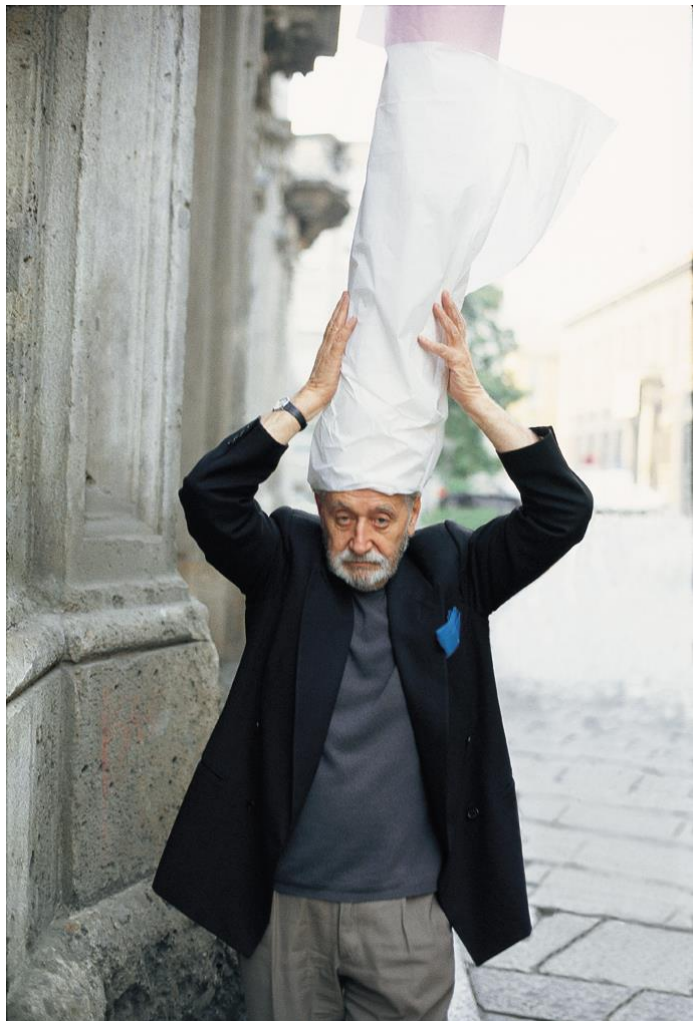
Ettore Sottsass © 1994 Yves J. Hayat