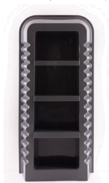
Ettore Sottsass, rare library of the Mobili Grigi series, circa 1970, Poltronova edition, estimate: 25 000 - 35 000 € / 29 300 - 41 000 $