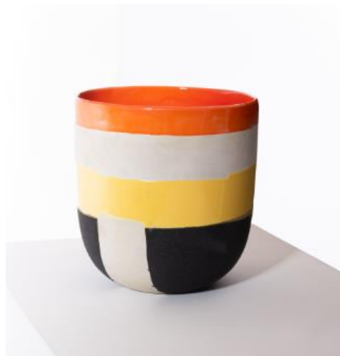
Ettore Sottsass, rare ceramics, 1959, biscuit and polychrome enamel, presented at the first exhibition of Ettore Sottsass to the Gallery Il Sestante, Milan, 1959, Estimate: 35 000 - 45 000 € / 41 000 - 53 000 $

In parallel to his first exhibition in a French museum, at the Center Pompidou in 1994, Sottsass was invited by the Manufacture of Sevres. There he created 14 pieces of extraordinary originality, pushing as per usual, the limits of traditional expertise of the august manufacture. Repertorio Sottsass will present two pieces resulting from the collaboration between Sottsass and the Sèvres factory, including a Cozek vase from 2006, made during the artist's second residency between 2005 and 2006 (estimate: 12 000 - 16 000 € / 14 000 - 19 000 $).