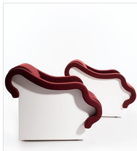
Ettore Sottsass, pair of Poupouf armchairs, circa 1970, Poltronova edition, estimate : 8 000 - 12 000 € / 9 200 - 18 000 $