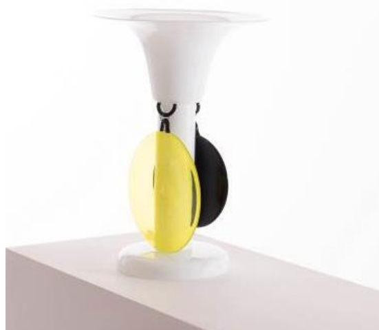
Ettore Sottsass, Sapho Cup , 1986, Edition Toso vetri d'arte for Memphis, estimate: 3 000 - 5 000 € / 3 450 - 5 750 $

Memphis pieces , produced in limited series, removing furniture from the mundane, are an ode to aesthetic and originality, but remain at the time reserved to the elite. The 1986 Sapho Cup , created in the midst of the Memphis movement, will be presented for an estimated 3 000 – 5 000 € / 3 450 - 5 750 $.