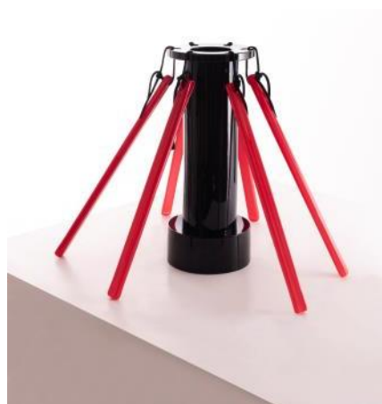
Ettore Sottsass, Cozek Vase - 2006 Edition Manufacture nationale de Sèvres, CIRVA, estimate: 12 000 - 16 000 € / 14 000 - 19 000 $